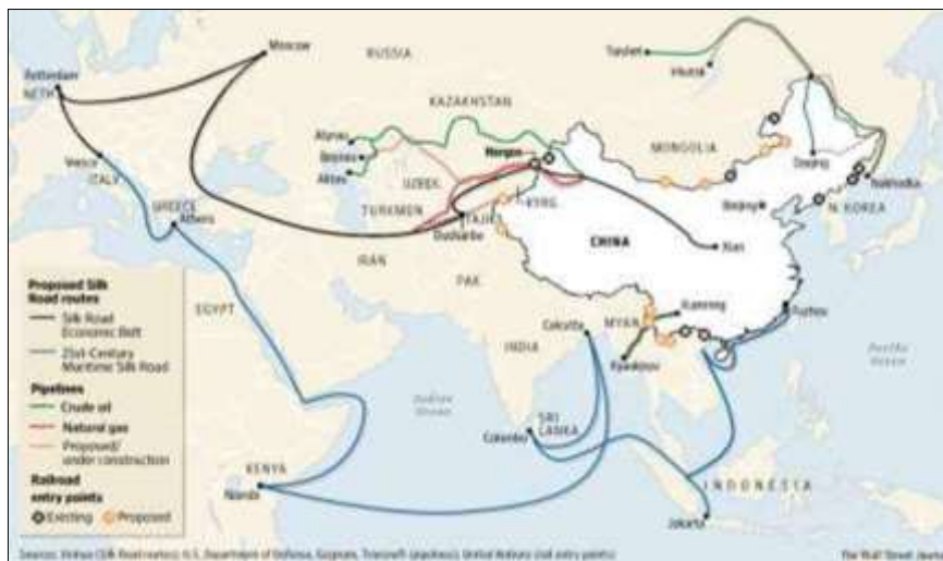
Fig 2: the path of silk roak

The countries that make up the Silk Road are classified into three sections by Zheng and Jia. The first section is the core of the Silk Road Economic Belt and consists of five Central Asian nations: Kazakhstan, Kyrgyzstan, Tajikistan, Uzbekistan, and Turkmenistan. The second section, known as the Silk Road Economic Belt, spans Central, Western, and South Asia, encompassing countries like Turkey, Saudi Arabia, Iraq, Afghanistan, Iran, Azerbaijan, Armenia, and Georgia, as well as parts of Russia, Afghanistan, India, and Pakistan. The Asia-Europe belt, which spans Europe and North Africa, is the third regional segment of the Silk Road economic belt. Algeria, Egypt, Libya, Germany, France, Britain, Italy, Ukraine, and other North African territories are the main nations in this area.